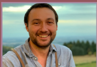
Chase Williams Black Walnut Inn