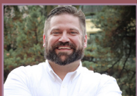
AJ Voytko The Porter Hotel, featuring Terrane Italian Kitchen