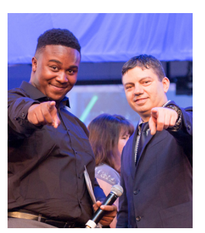
Representatives from Friends of the Children-Portland at the 2018 Classic Wines Auction.

As we embark upon another milestone year, we recognize the many individuals and businesses who have helped make Classic Wines Auction one of the top funding resources in our community. Together, we continue to change lives and that's something to celebrate!